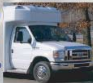
Dual Door Cab with Co-Pilot Seat

RR#2, 21051 MISSOURI RD THORNDALE, ON N0M 2P0 519-461-1140 (FAX) 519-461-0523 WWW.OVERLANDCUSTOMCOACH.COM