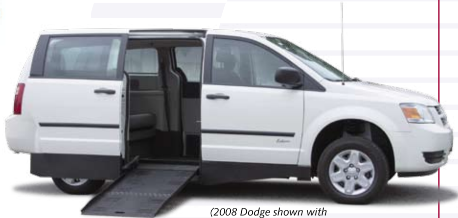
(2008 Dodge shown with commercial-grade steel ground effects)

Taxi, Limousine & Paratransit Association