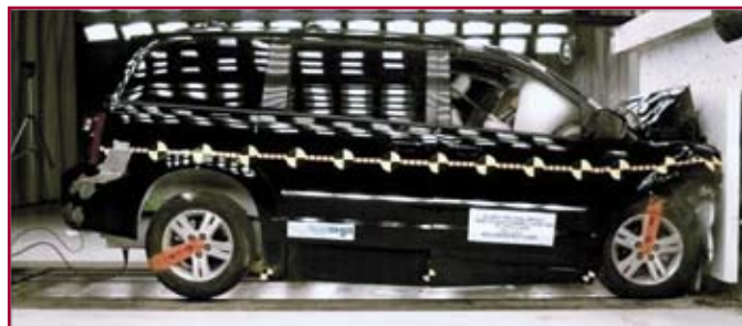
2008 Eclipse Dodge Grand Caravan Crash Test Eclipse Vehicles are FMVSS & CMVSS Crash Test Approved