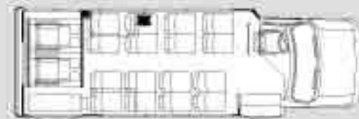
16 Passenger - 2 Wheelchairs - Rear Lift