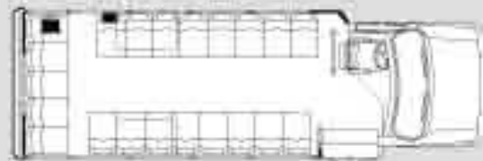
21 Passenger Perimeter Seating