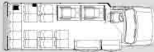
15 Passenger - 2 Wheelchairs - Front Lift